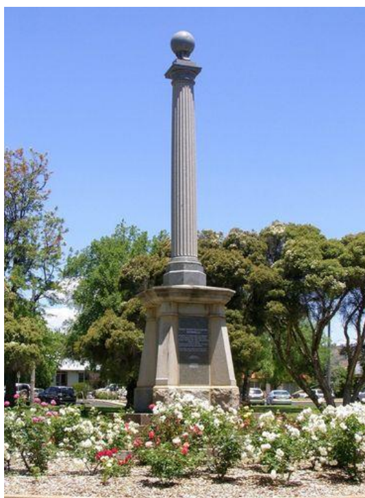
Mudgee District Fallen Soldiers Memorial